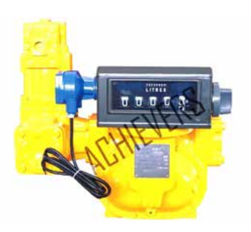
MECHANICAL REGISTER WITH PULSER