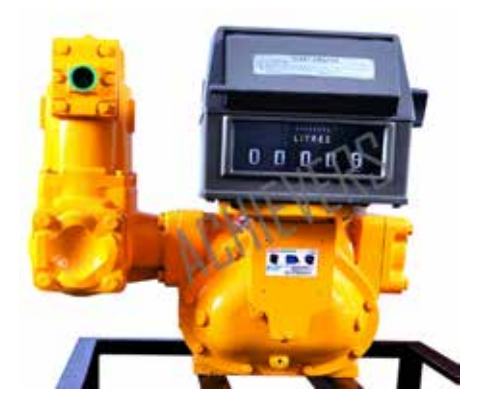
MECHANICAL REGISTER WITH PRINTER