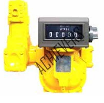
METER WITH MECHANICAL REGISTER