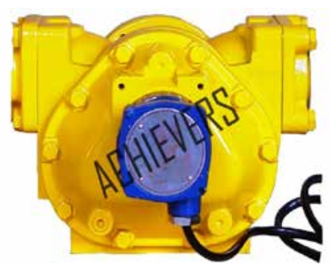
METER WITH PULSER